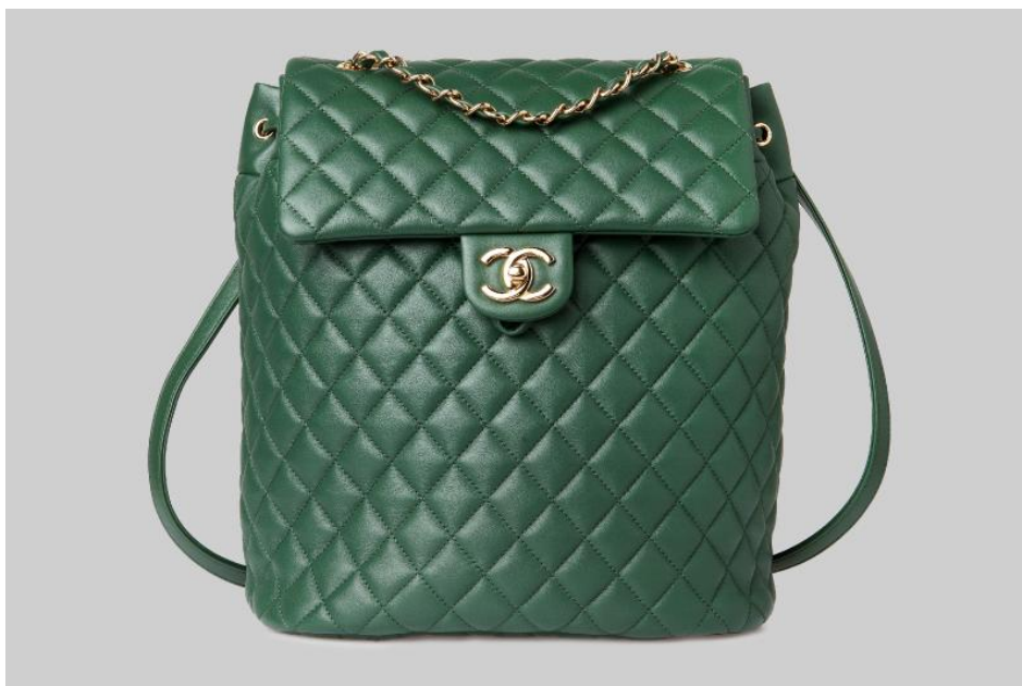
CHANEL GREEN BACKPACK

Anything can catch your eye, but it takes something special to catch your heart.